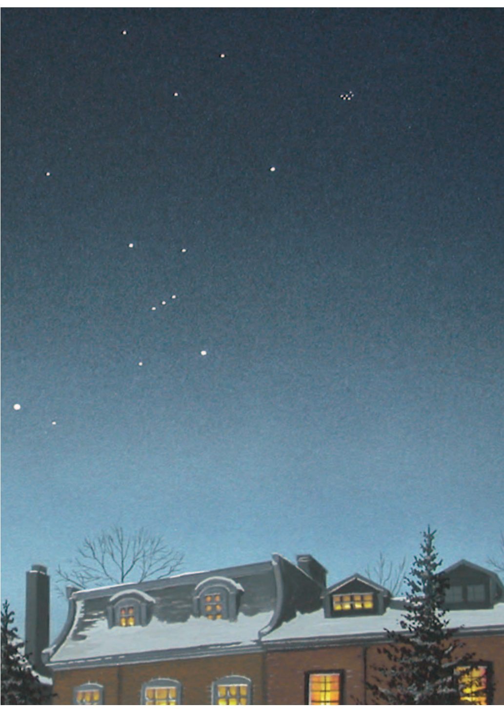
Left: Winter constellations in a suburban or rural-suburban transition sky, with the winter Milky Way visible but not dramatically so. Such a sky, fairly good by many people's standards, might rate 4 or 5 on Bortle's scale. Many fainter stars than are depicted here would be visible with close scrutiny. Right: The same constellation panorama in an urban, Class 8 or 9 sky. For another way to rate sky brightness, see page 138.

ly invisible. This is an observer's Nirvanal Class 2: Typical truly dark site. Airglow may be weakly apparent along the horizon. M33 is rather easily seen with direct vision. The summer Milky Way is highly structured to the unaided eye, and its brightest parts look like veined marble when viewed with ordinary binoculars. The zodiacal light is still bright enough